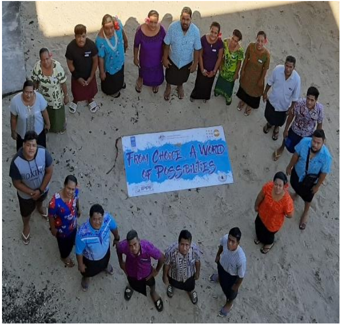
Youth volunteers in Samoa are actively involved in various events organized by the SFHA.