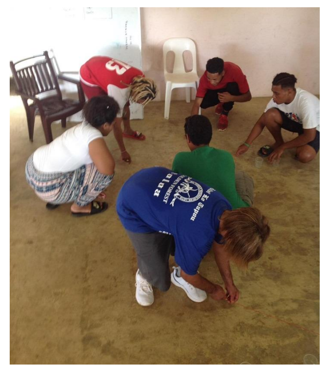
It's all about Fun and building youth networks on Friday Fun Days

Training and workshop sessions included SGVB fundamentals, SRH policy mapping and updating KFHA's MoU with the Kiribati Ministry of Health.